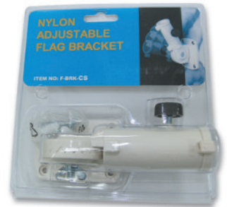
MP-FS-DP Plastic swivel flag holder • Easy to use durable Nylon adjustable flag bracket with lock screw. • Adjustable angle from 0 to 90 degree at 15 degree increments. • Accept pole upto 28mm in diameter for flag pole or 6mm in diameter for planter poles.