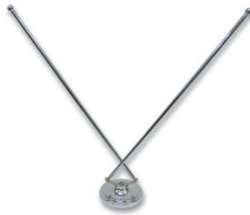
MP-FS-DP Desktop pole flag stand - Twin pole